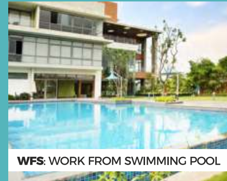
WFS: WORK FROM SWIMMING POOL

WE ARE ALL FAMILIAR WITH WFH. BUT LIVING HERE WILL ADD A FEW MORE JARGONS TO YOUR LIFE.