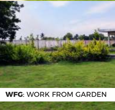
WFG: WORK FROM GARDEN