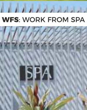
WFS: WORK FROM SPA

COME EMBRACE THE FUTURE, OWN A LAND WHICH IS FUTURE ENABLED.