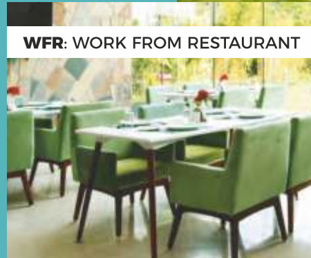
WFR: WORK FROM RESTAURANT

WE ARE ALL FAMILIAR WITH WFH. BUT LIVING HERE WILL ADD A FEW MORE JARGONS TO YOUR LIFE.